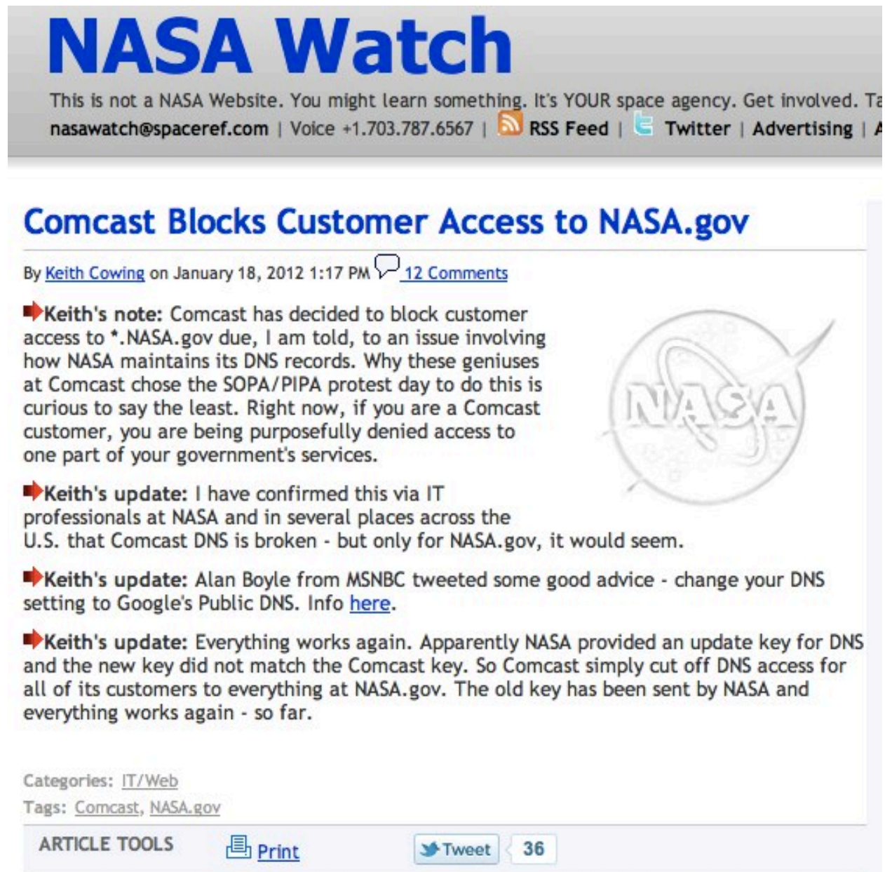
Figure 4: NASA Watch, http://nasawatch.com/archives/2012/01/comcast-blocks.html